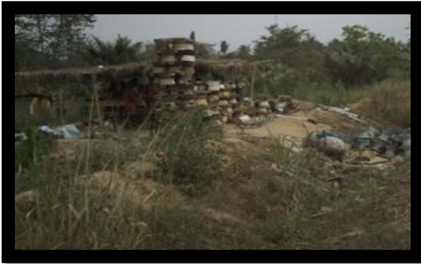
TOYOLA FACTORY 2006