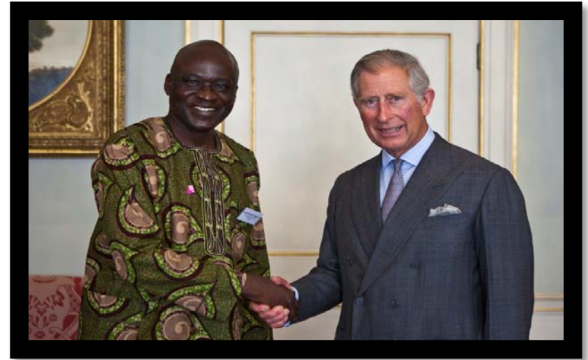
ASHDEN INTERNATIONAL GOLD AWARD 2011