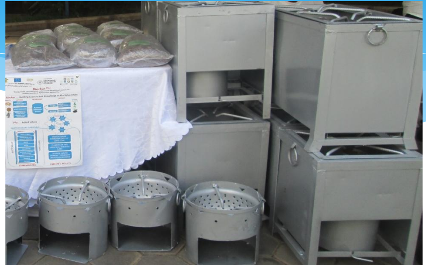
Improved Cookstove & briquettes from Asa Initiative