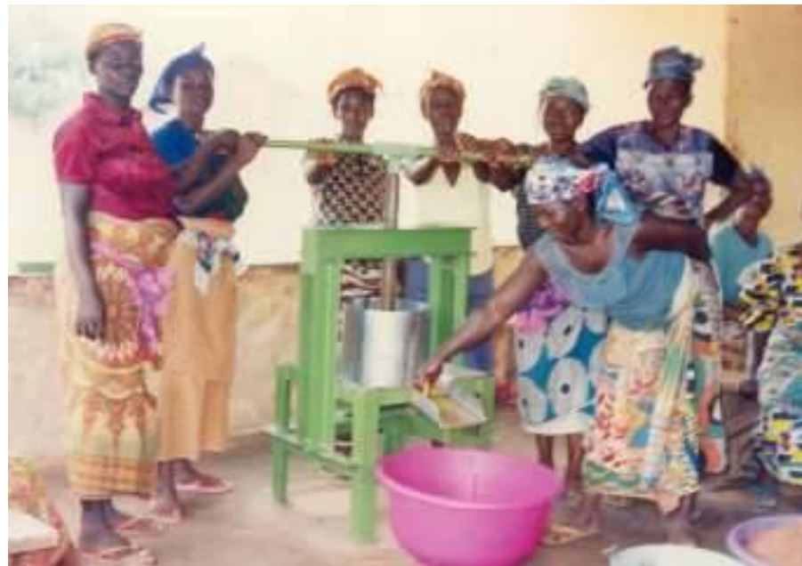
Women trained to produce clean fuels