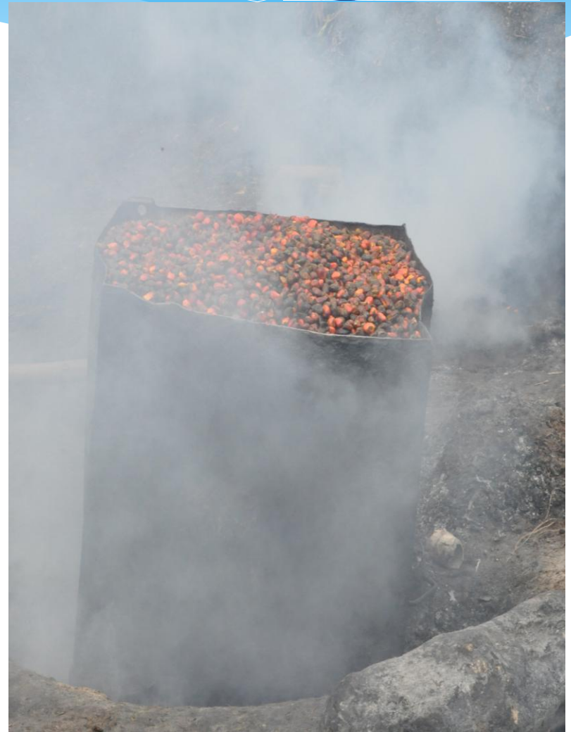
Intense smoke and fires from wood fuels in Oil Processing