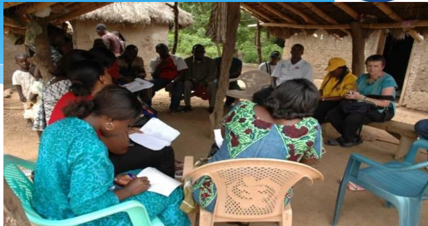
Research and Advocacy