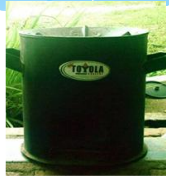
Toyola Energy Improved Cookstove