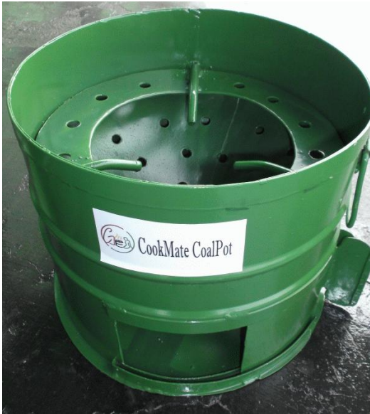
CookClean Improved Stove