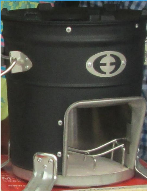
Envirofit Improved Cookstove