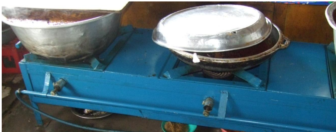
Anomena Manufactured LPG improved Stove