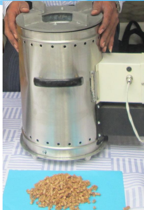
Abellon Stove and Briquettes