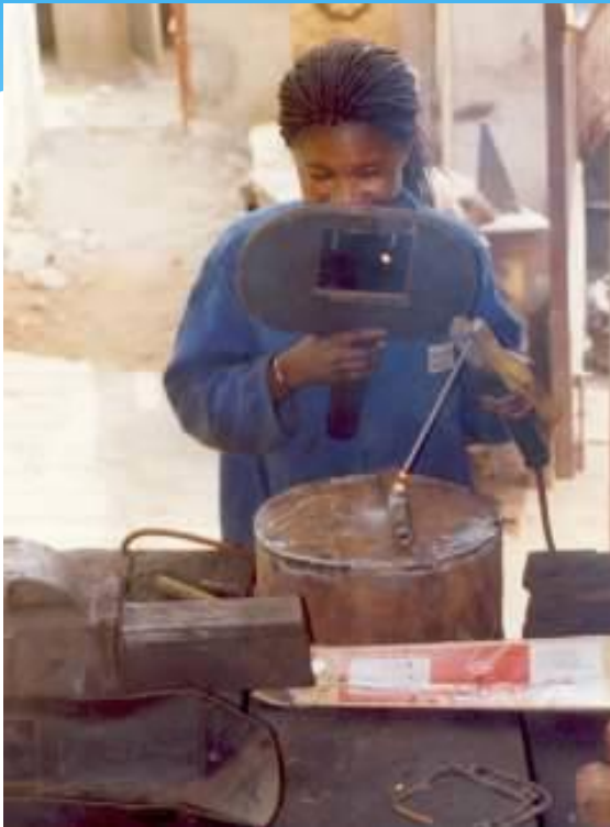
GHACCO organizations aim to train young women to become “Energy Technicians” to produce, operate and maintain equipment