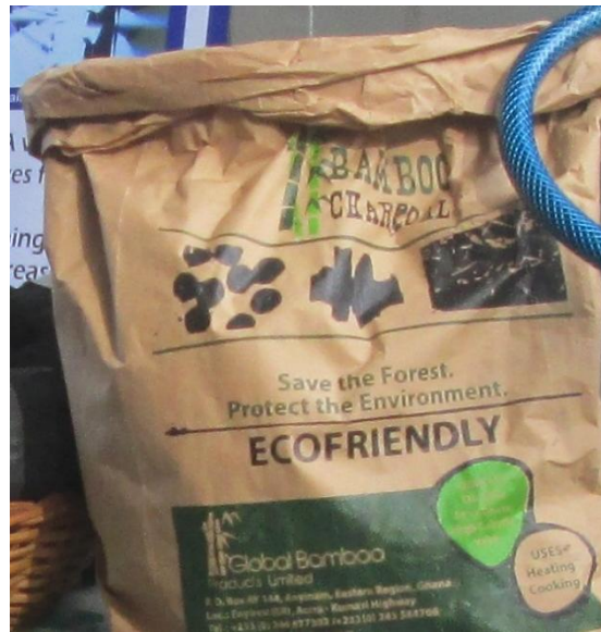
Global Bamboo Briquettes