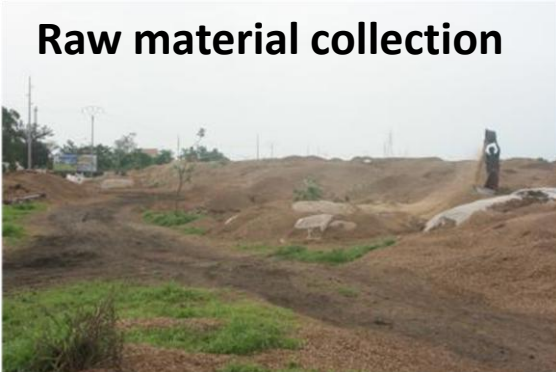
Raw material collection