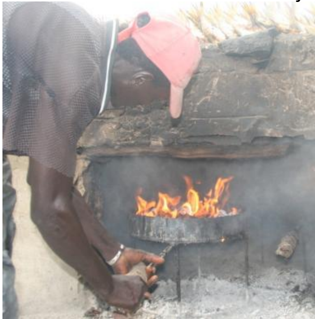
Twin Stove in Tanji